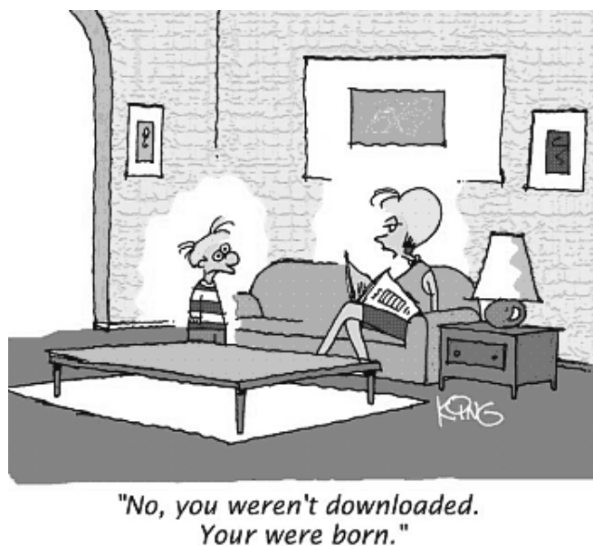
Figure 1. A typical figure

Figure and table captions should be centered if less than one line (Figure 1), otherwise justified and indented by 0.8cm on both margins, as shown in Figure 2. The caption font must be Helvetica, 10 point, boldface, with 6 points of space before and after each caption.